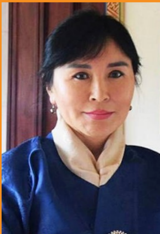
HRH Ashi Kesang Wangmo Wangchuck