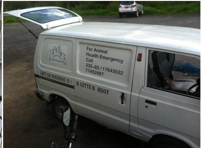
Mobile clinic operation