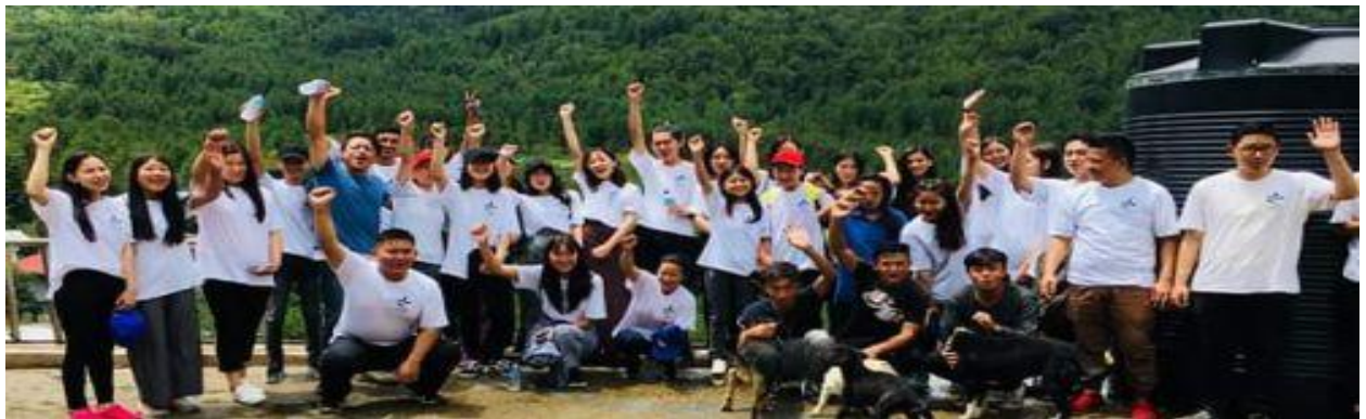
Volunteers engaged in shelter clean up works