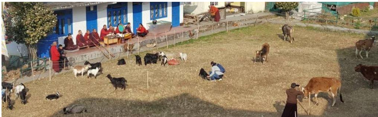
Tsethar of some animals carried out in 2018