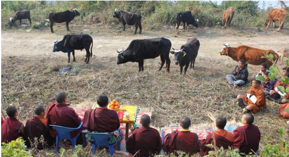
Tsethar of cattle in Tsirang