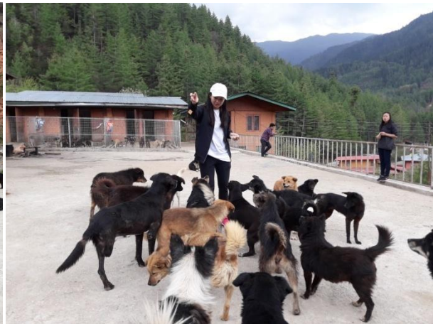
A visitor feeding the dogs