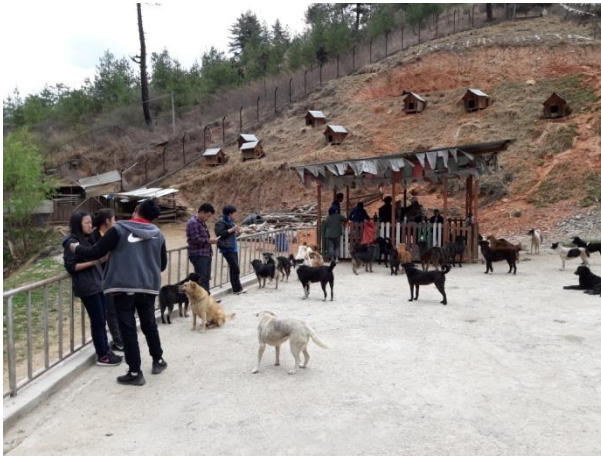
Young volunteers at the shelter

Maintaining the dog shelter located in Serbithang, Thimphu is one of our biggest and daily operations in Thimphu dzongkhag. We have 40 sheltered dogs, all old, crippled and paralyzed, who wouldn't survive on their own in the streets on their own. The sheltered dogs are fed thrice a day by Caretakers and sometimes people visit our shelter bearing to feed the dogs.