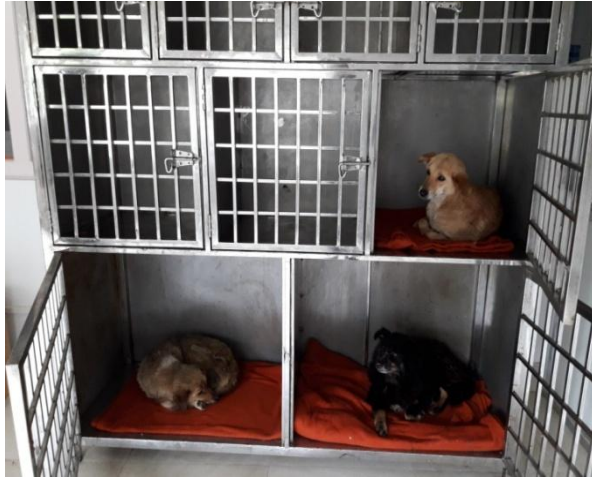
Emergency ward at NVH