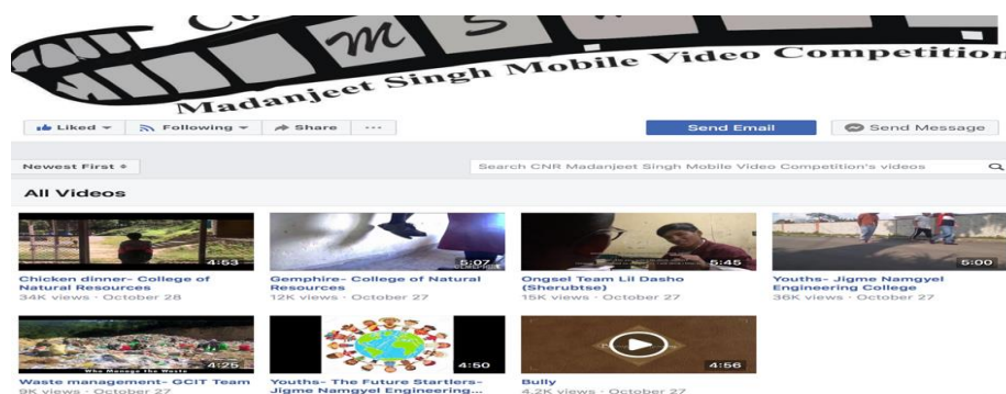
Figure xiv: Screenshot of the video entries of mobile video competition

A total of seven video entries participate in this year’s competition, two from CNR and five from other Royal University of Bhutan Affiliated colleges. The video competition is sponsored from the UMCSAFS program fund.