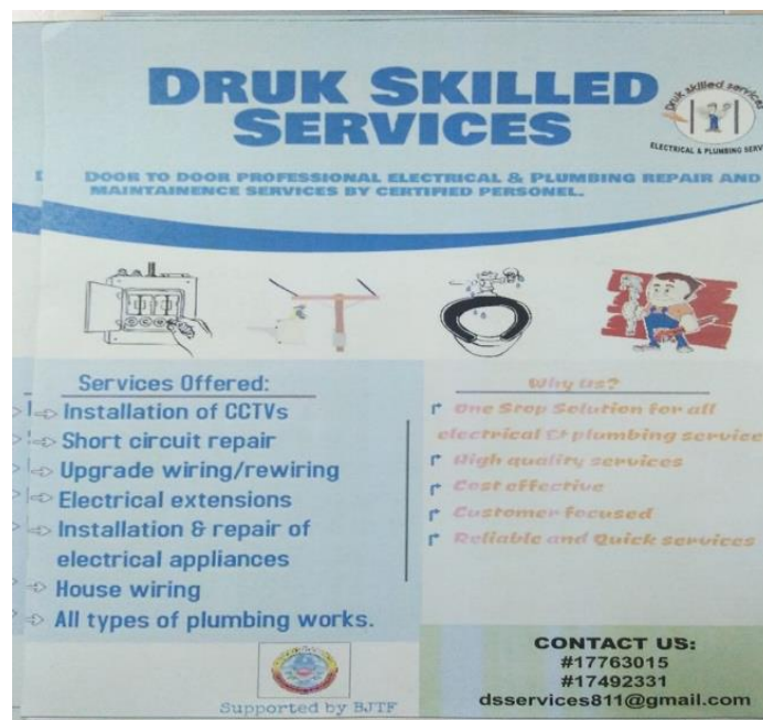
Figure X. Druk Skilled Service – TTI Youths