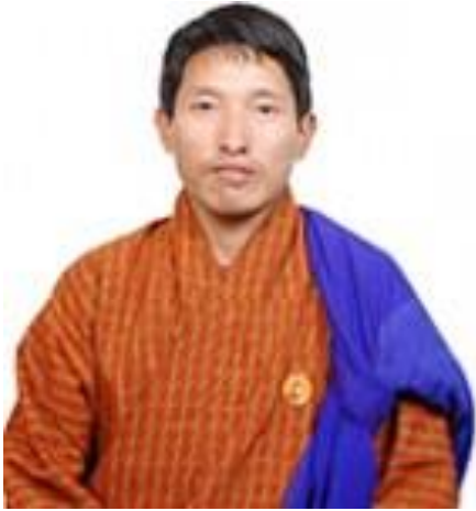
Figure xii: Mr. Dorji Khandu, Member of Parliament of Bhutan