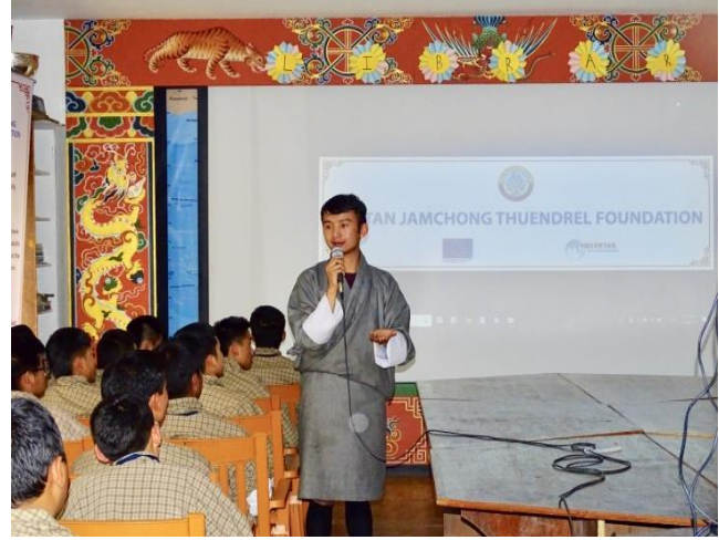
Figure vi. Some snippets from our advocacy and awareness program at various schools

For TTIs, partnerships programs were held for promotion of entrepreneurship among the trainees and highlighting the importance of skilled jobs in the 21 st century. BJTF entered into partnership with four TTIs through the signing of MoUs. The main objective of the partnership is to facilitate the interested TTI students in setting up skilled businesses.