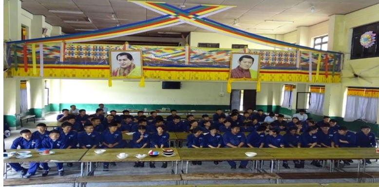
Figure vii. Snippets from the partnership program at TTIs

Questionnaire survey on ‘youth aspiration’ was also conducted for the class X, XI, & XII students of the respective schools, we are currently compiling the report for analysis which will be carried out at the end of the project duration.