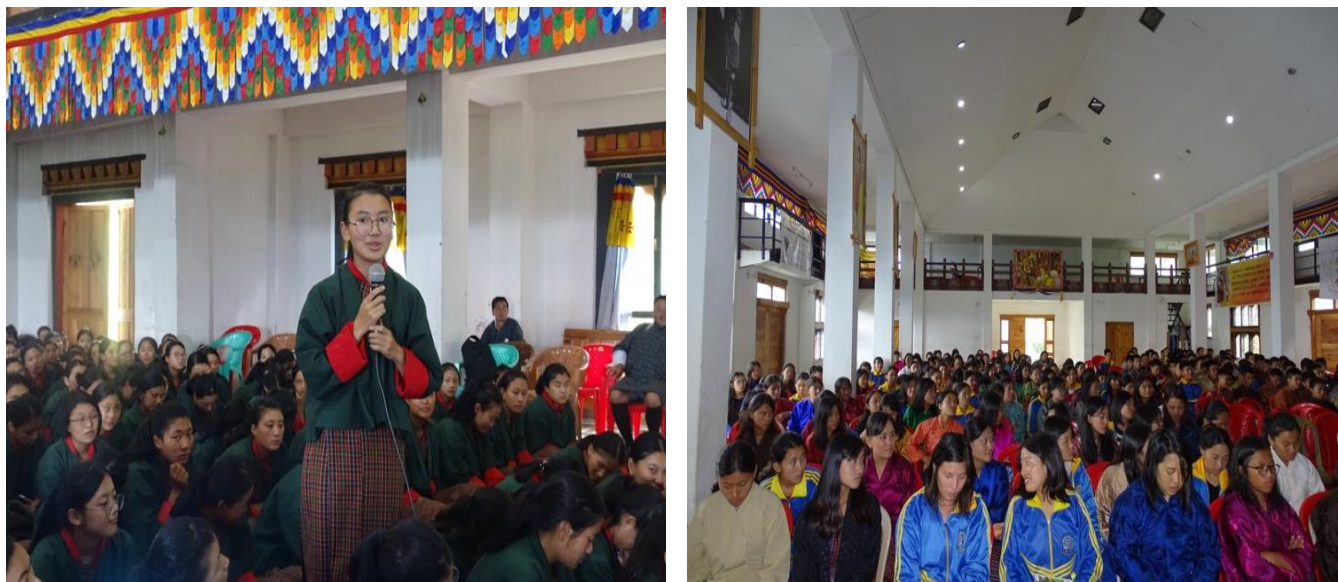
Figure ix. Students attending the advocacy and awareness program