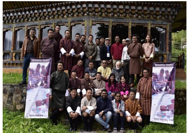
Figure xv: (i) Elf camp participants (ii) Boot camp participants